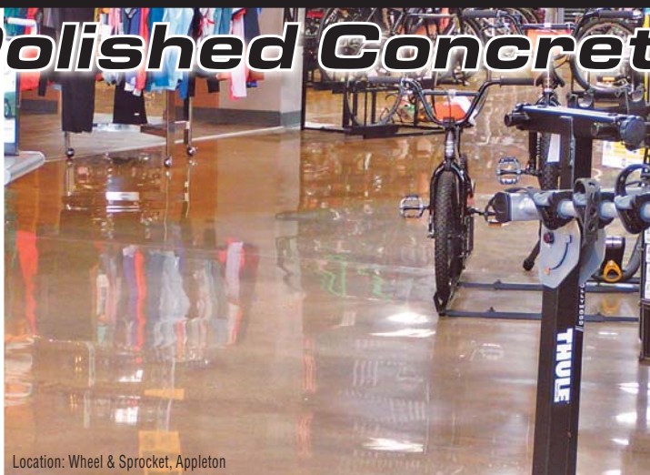
Location: Wheel & Sprocket, Appleton